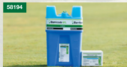
Warm Season Herbicide Solution