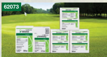
Fairy Ring Solution