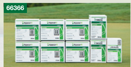
Greens Protection Solution