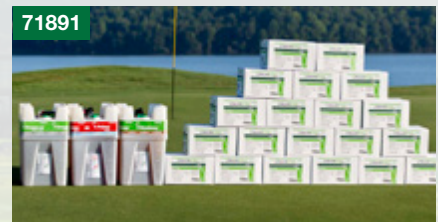
Fairway Starter Solution