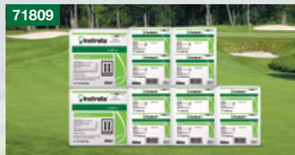
Contend Winter Solution