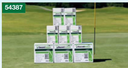
A 2 Z Solution

Commitment Period: In order to be eligible for the prices and terms for the products described in this Pallet Offer, golf courses and professional applicators must commit to purchasing any of the Golf Pallets described below from a Syngenta Authorized Agent/Retailer between October 1, 2021 and December 8, 2021