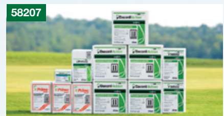
All Season Solution