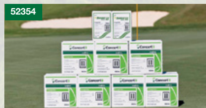
Snow Mold Solution